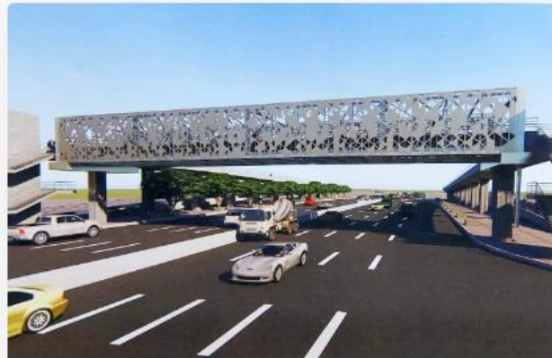
Abo Homous Bridge