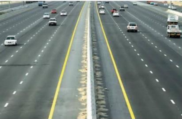
Ring Road Expansion