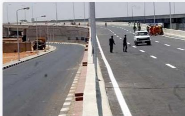
Nozha Airport Bridge