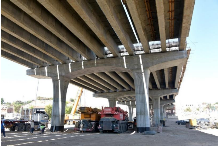
محور خزان اسوان