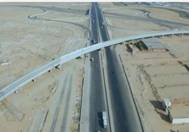
Elmoaahda and Geneva Bridge